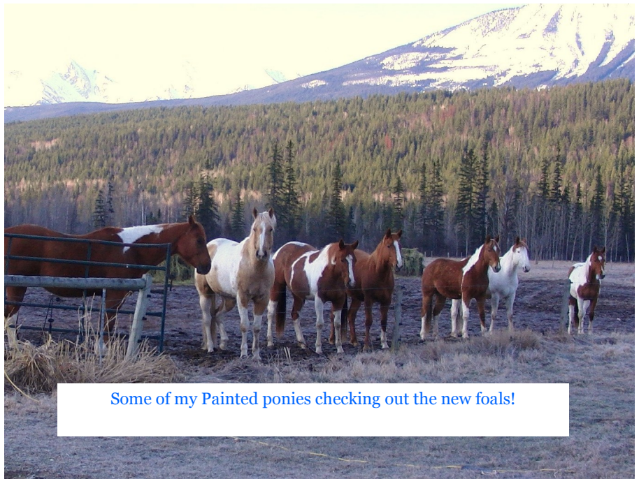
Some of my Painted ponies checking out the new foals!