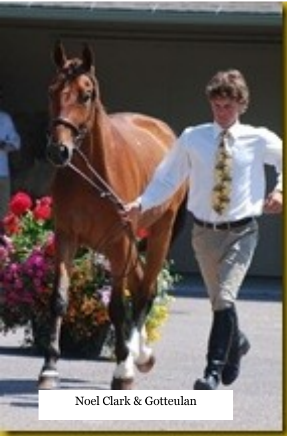
Noel Clark & Gotteulan

In June, we were thrilled to be able to invite Jane Bartle-Wilson from the UK to run a coaching clinic at Cochrane. The first day was an open audit day where 40 auditors learned as Jane coached three groups of increasingly skilled riders on the flat in the morning and over jumps in the afternoon. The next three days were focused on intensive coaching skills with 10 coaches. Each day, coaches brought their own students and worked on various skills with mentorship and feedback from Jane as well as from the other coaches.